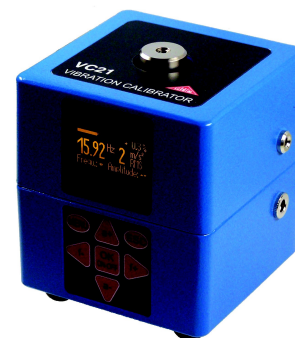
Figure 5: Vibration calibrator VC21

Please read also the VM31 instruction manual.