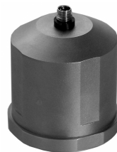
Figure 2: KS823B