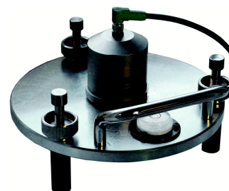
Figure 4: Tripod floor plate Mod. 729

Useful accessories for the measurement of ship vibration may be the tripod floor plate Model 729 and the magnetic base Model 508 (Figure 4).