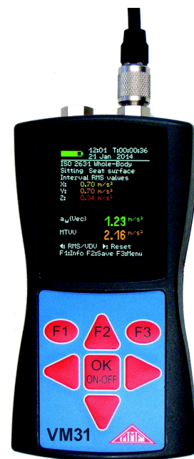
Figure 3: Vibration meter VM31